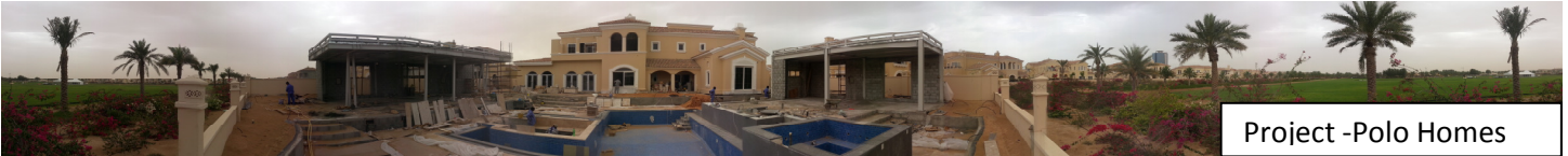
Project -Polo Homes

Since Jun'10 to Feb ' 2014 with Al Reyami Interiors, Abu Dhabi, UAE