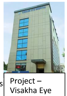
Project – Visakha Eye