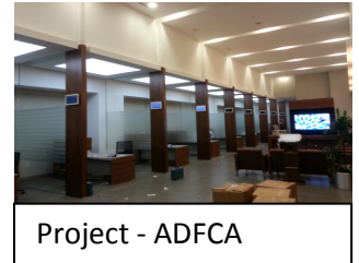
Project - ADFCA

Jun'09 to May'10 with Signs, Hyderabad, India