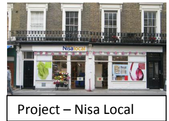
Project – Nisa Local